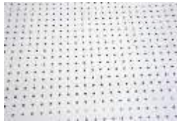
1 meter back wall only