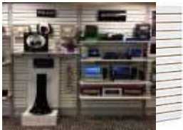
1 meter back wall only