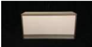
White Counter with Storage 42"H x 42"W x 18" D- Lockable