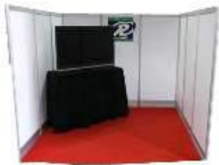
Monitor – Pop up