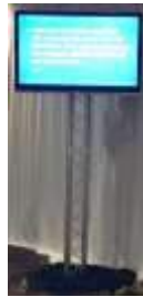
Monitor – truss mounted