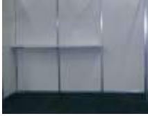
Wall shelf 12" deep x 1m long