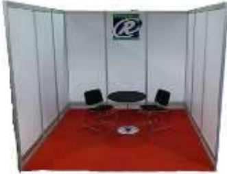
1 cocktail table & 2 side chairs