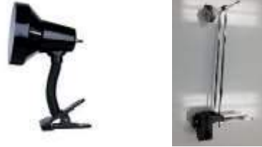
10 watt LED Clip Light – electrical not included