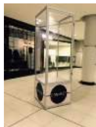
Display Case – Plex Custom height and graphics