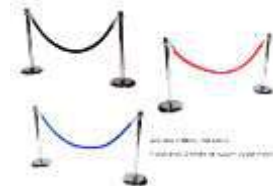
Rope Stanchion – 6ft Black & Red