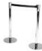
Retractable Stanchion 2 Stanchions & 1 Tape