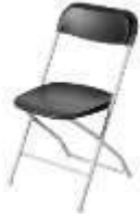
Folding Chair Black, Grey