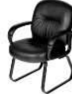
Executive office Chair - Black