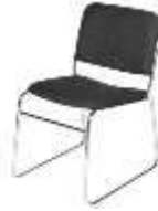
Upholstered Side Chair Black, Grey