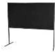
Poster Board 4'x6' 4'x 6' or 4' x 8' Horizontal