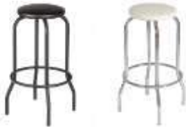
Bar Stool – Backless Black, White