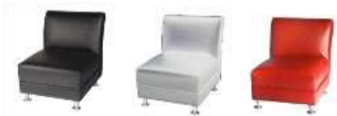
Armless Single Seat Black, Red, White