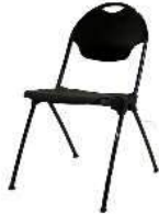
Stackable Chair Black