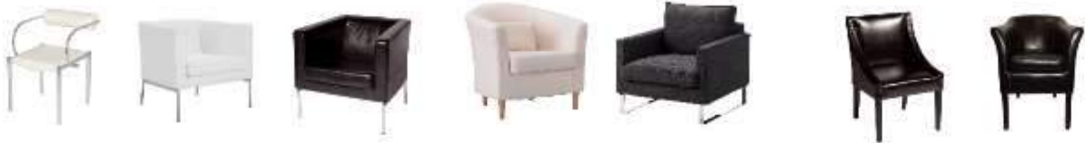
Stage Series - Black, white