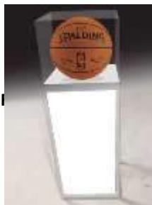
Display Case Plex -