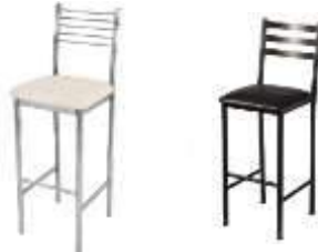
Bar Stool – Ladder Back Black, White